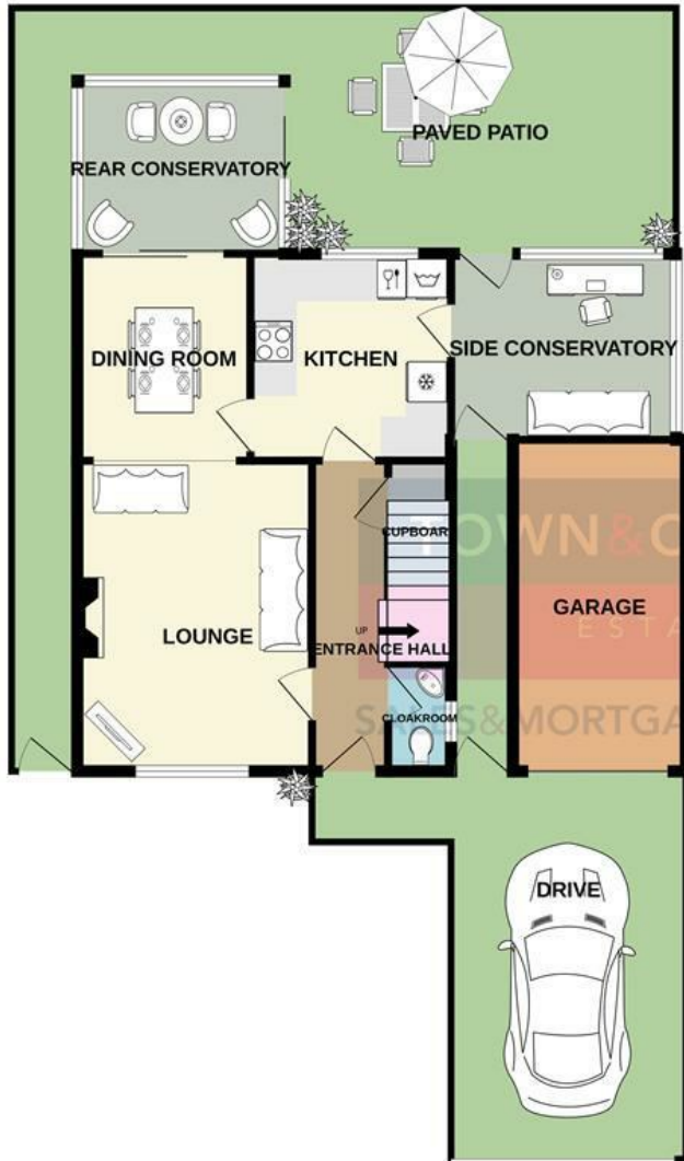
GROUND FLOOR 742 sq.ft. (68.9 sq.m.) approx.